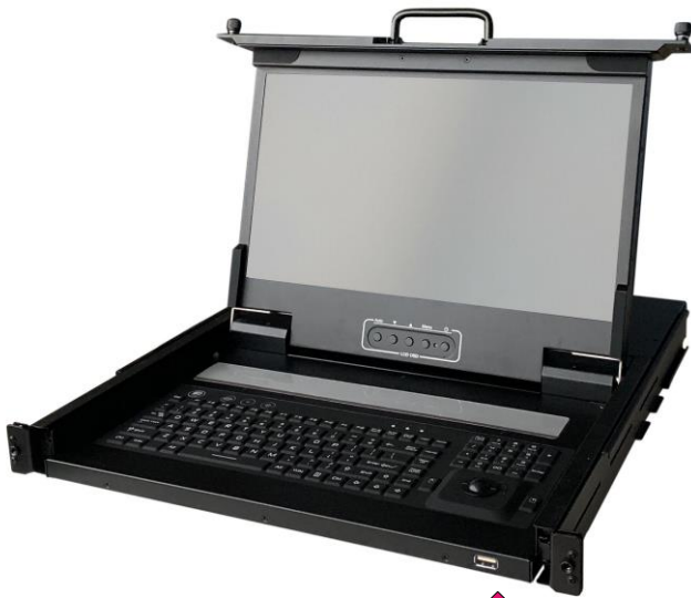
(USB Port for device access)

Optimize rack space. Maximize rack monitoring