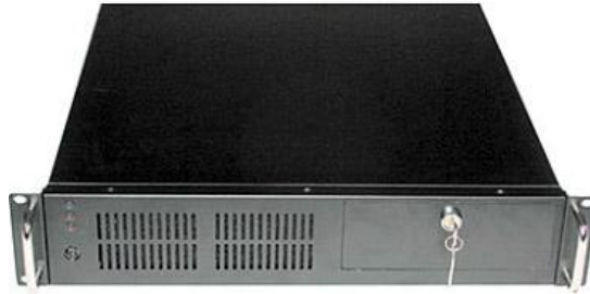
2U 19" Industrial Rack- Mount Chassis