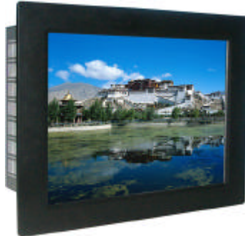
With Aluminum front panel