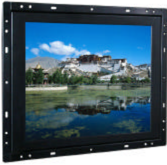
Open frame structure