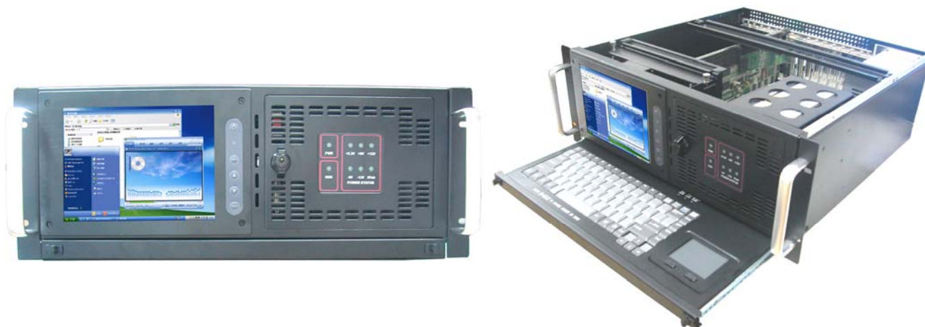
5U Rack Mount 10.4 TFT LCD workstation Front Accessible KB/Touch pad drawer