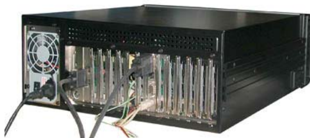
4U Rack Mount 8" TFT LCD workstation