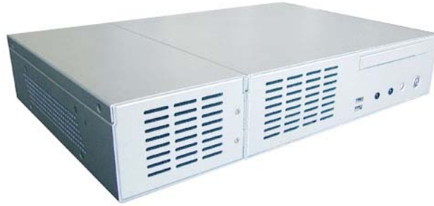
Smallest Industrial Appliance(P4 Level) With 2 Expansion Slot