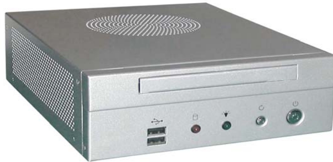
Smallest Industrial Appliance(P3 Level)