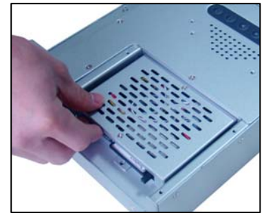
Card box Inserting Way